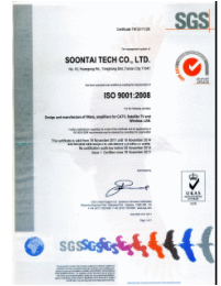
SGS ISO 9001 Certificate TW12/11128